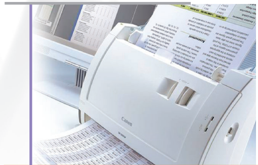
Reliable and Fast Document Capture

Bundled with CapturePerfect® 3.0, Adobe® Acrobat® Standard, and OmniPage® SE 4, the DR-2050SP and DR-2050C devices become more than just scanners. They offer scanning options such as save, print, and e-mail-scanned images with one-click simplicity plus built-in OCR capabilities to make it easier to create searchable PDF files. Bundled with this latest document imaging software package, you'll find that the DR-2050SP and DR-2050C scanners are small investments worth making.