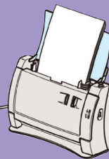
image rotation, next, and previous image. The DR-2050SP scanner automatically adjusts itself to the projector's level of resolution, up to SXGA (1280 x 1024). And images are scanned in 24-bit color, delivering high quality that's clear from edge to edge. This scanner is a powerful, ultra-compact scanning device that's capable of sharing information with just one push of a button.